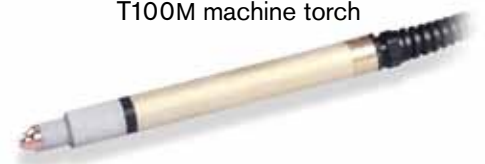
T100M machine torch