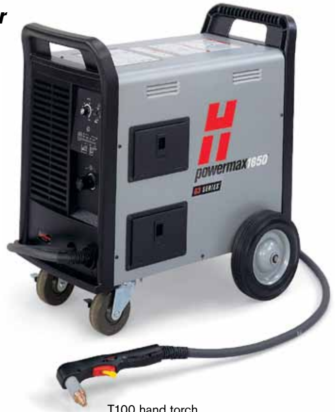
T100 hand torch